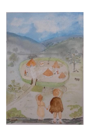
Page 2 5yrs to 7yrs