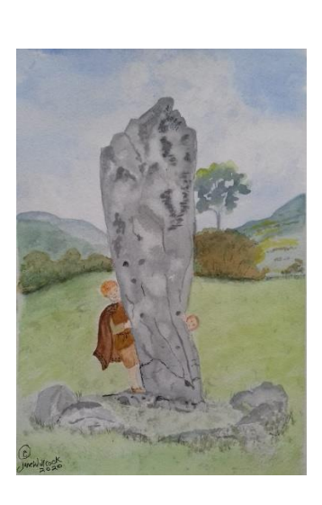
Page 3 Little ones 4 & 5 yrs